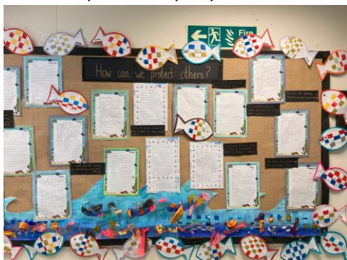
Year 1 How can we protect others?

Constantly caring Offering help Making a difference Putting others first Always listening Sensitive to suffering Service in action Interested in others Offering care and concern Noticing a need.