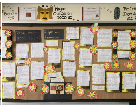
Year 3 What makes a good leader?