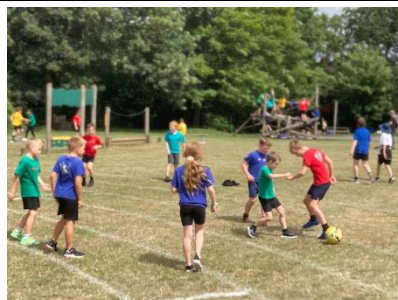
Friendship at breaktime