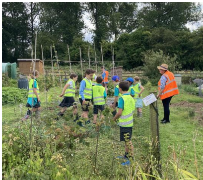
Gardening Club Term 6