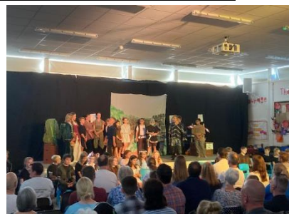
Courage to perform on stage