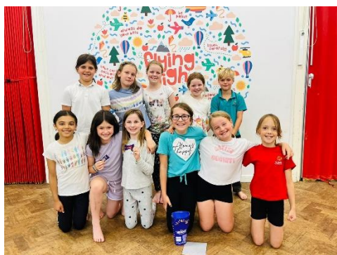
Dance Club Term 6