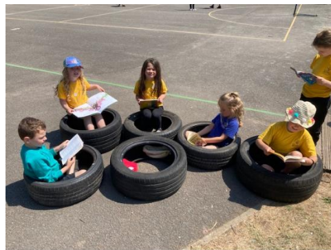
Fun at Lunchtimes