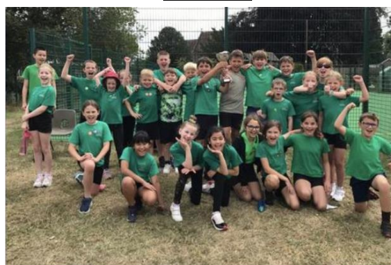
Sports Day Excellence