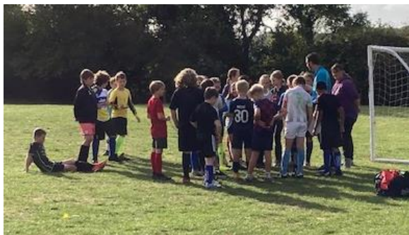
Year 5 and 6 Football Club