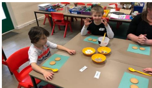
UFO cakes in Y2