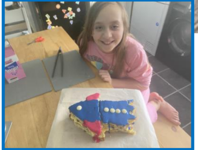
Space baking in Y5!