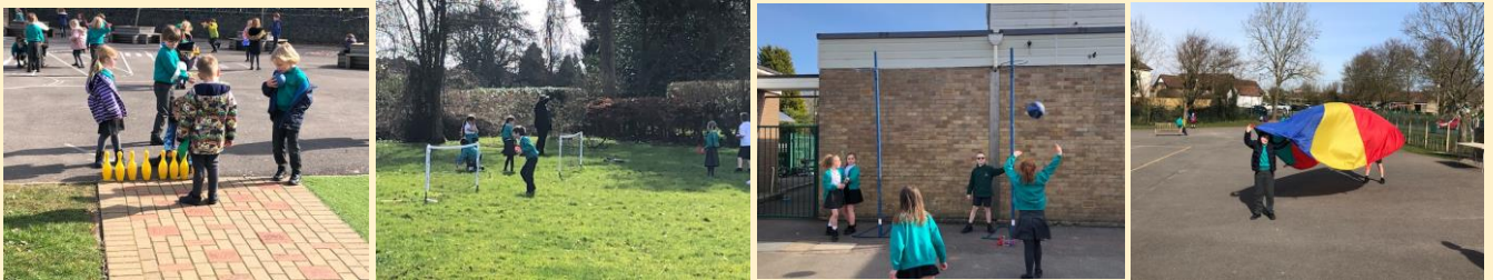
The St Helen's community, children, families and staff - 'Flying High - Soar on Wings Like Eagles.'