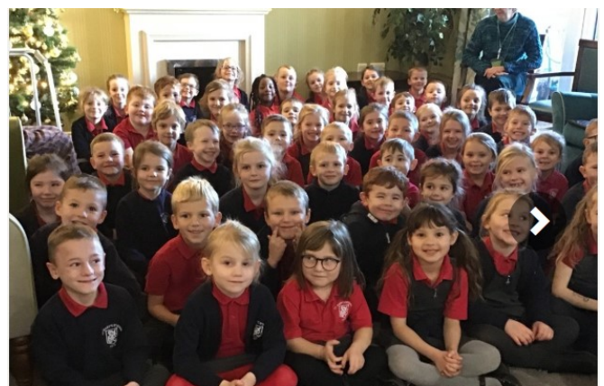
Year 1&2 children from St Mary's visited a local care home to spread some joy! Their topic: "What makes me happy?"

Our work on the curriculum will continue to develop. We look forward to sharing more of the impact from this project with you over the next few years.